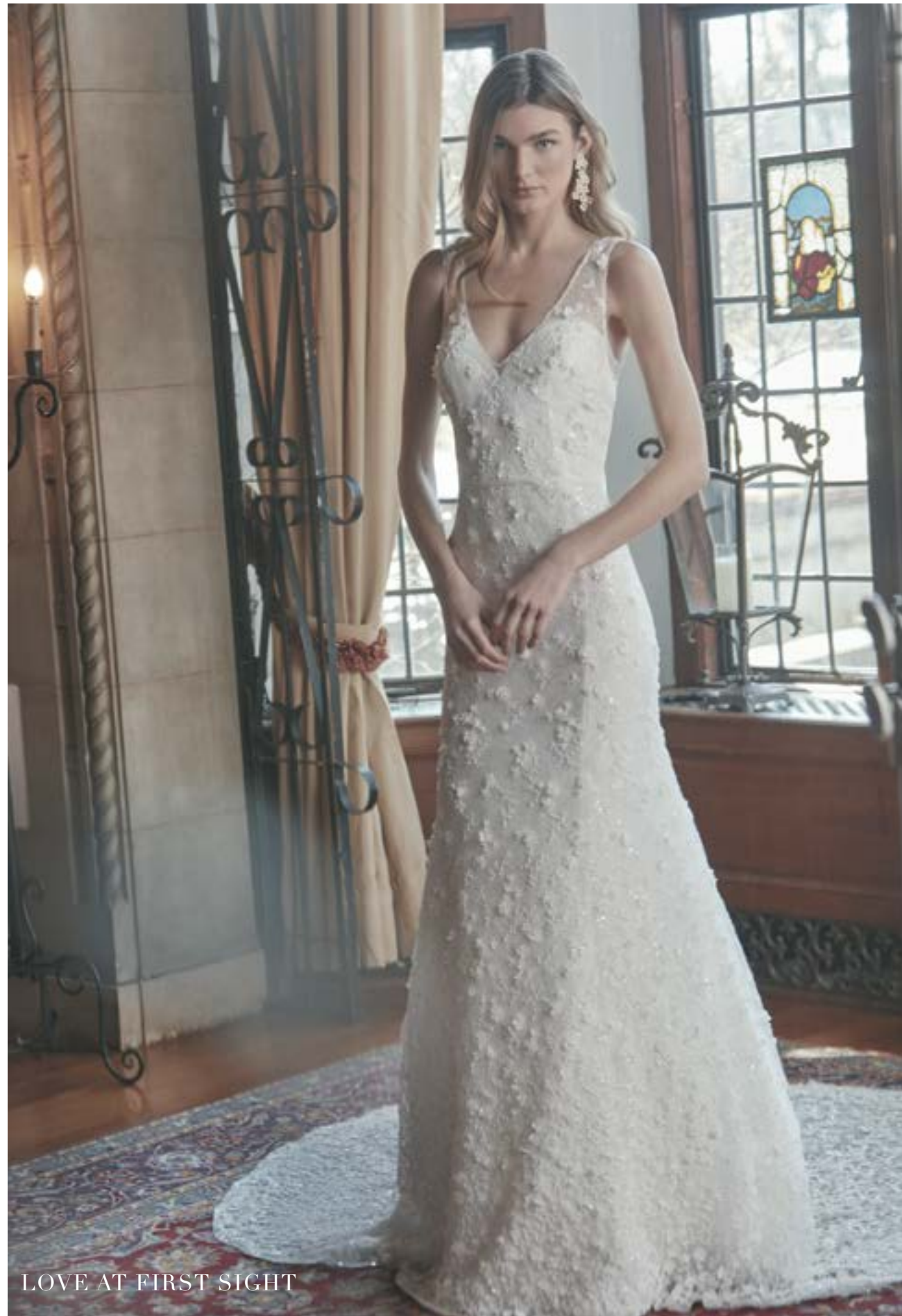
LOVE AT FIRST SIGHT