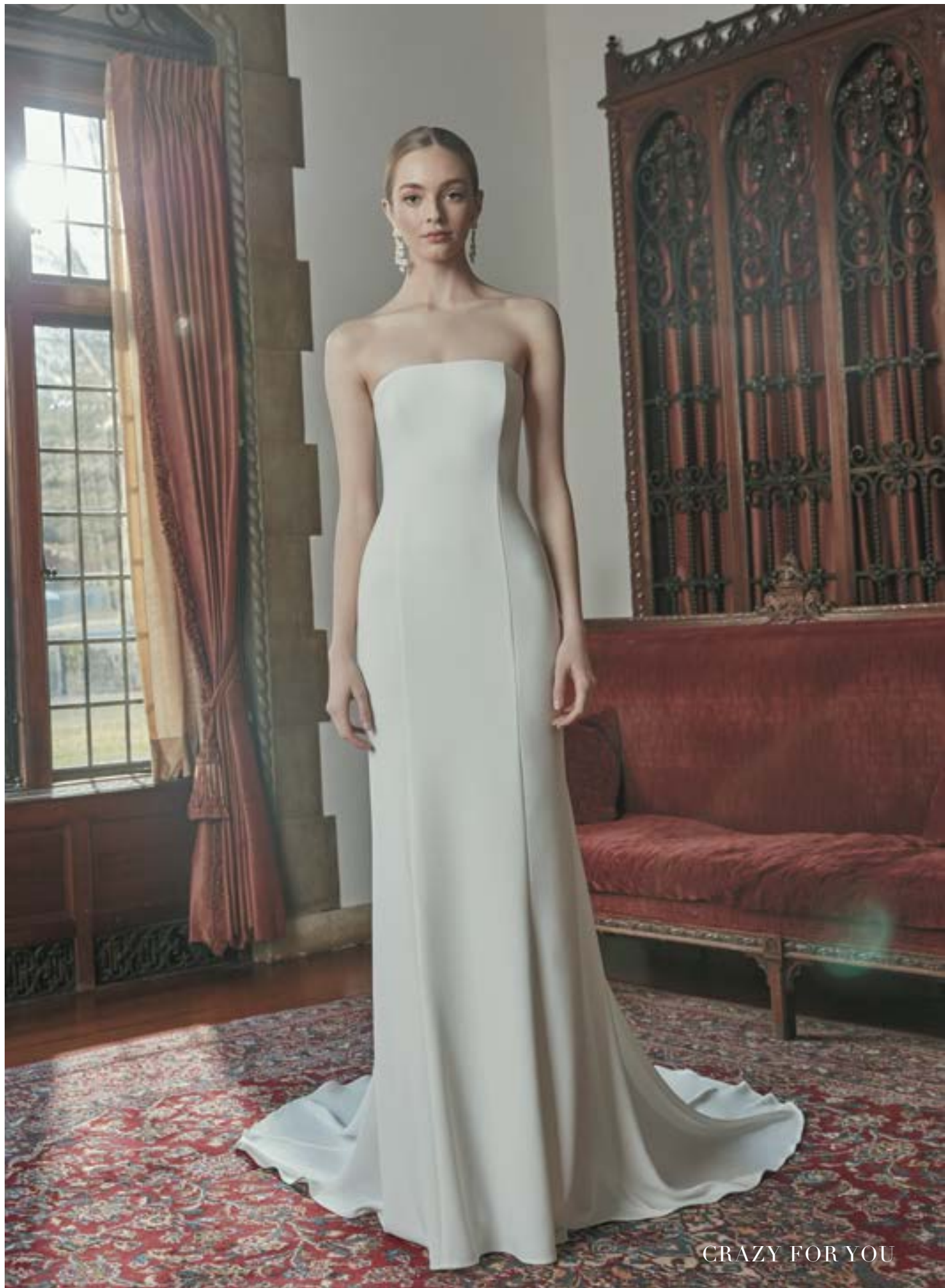
CRAZY FOR YOU